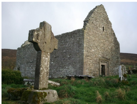
Aghowle church, 12th century

forever, but the angel appeared to him again and commanded him to go further.