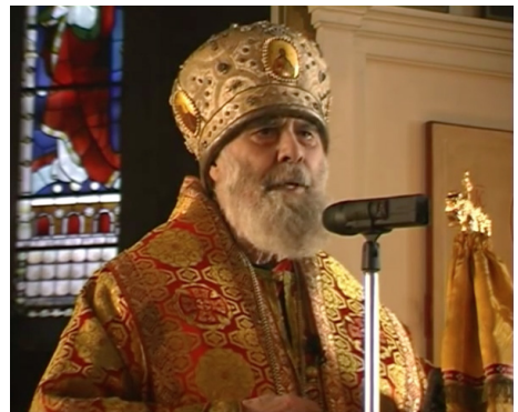
Metropolitan Anthony of Sourozh

In a night similar to this one, a winter night, in a manger was born the Son of God Who has come into the world to bring us a new dimension of life, to proclaim to us God’s truth about Himself and God’s truth about men, and not only proclaim it, but to make it possible for us to participate in