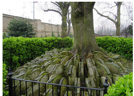
'Thomas Hardy ash tree'

Concerts are regularly arranged at this church. It is open for visitors seven days a week. This parish belongs to the conservative Anglican tradition known as 'the High Church', they practice