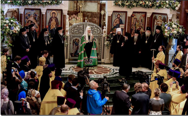
Liturgy at Dormition Cathedral during the visit of Patriarch Kirill

Orthodox tradition. We have warm relations with them, and there is a sincere friendship between us which is very important to us and we want to keep it.