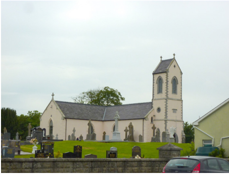
Catholic Church of St Finnian in Clonard

by Finnian. A ninth-century St Finnian's cross along with a tenth-century granite font have survived in this village too. Today there is a Russian Orthodox parish in Belfast in Northern Ireland dedicated to St Finnian.