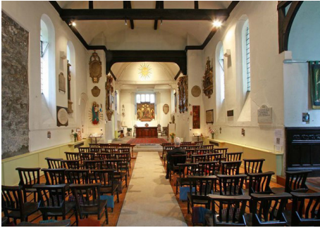
Inside Old St Pancras Church

burning incense and lighting candles. Masses are celebrated on Sundays and Mondays at 9.30 am, Tuesdays at 7 pm, masses in honour of Our Lady of Walsingham – on the first Saturday of each month. The gardens are open daily from 7 am till dusk.