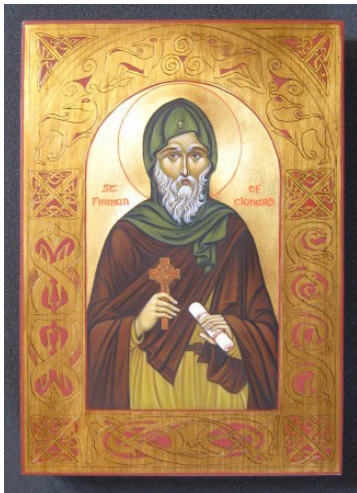
Icon of St Finnian

Finnian meant to go to Rome after his training in Wales, but an angel appeared to him in a vision and told the saint to return to Ireland, where he was to become “a teacher and tutor of Irish Saints”. Among the future disciples of Finnian was St Columba, one of the greatest early Irish missionaries. After some twenty or thirty years in Wales, Finnian returned to Ireland, where he founded a great number of churches and monasteries, for example, at Aghowle (Wicklow) and Mugna Sulcain. The holy man liked Aghowle very much and wanted to stay there