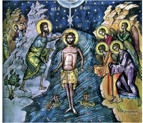
The Theophany icon

There is a third century dialogue about the services for Theophany between the holy martyr Hippolytus and Saint