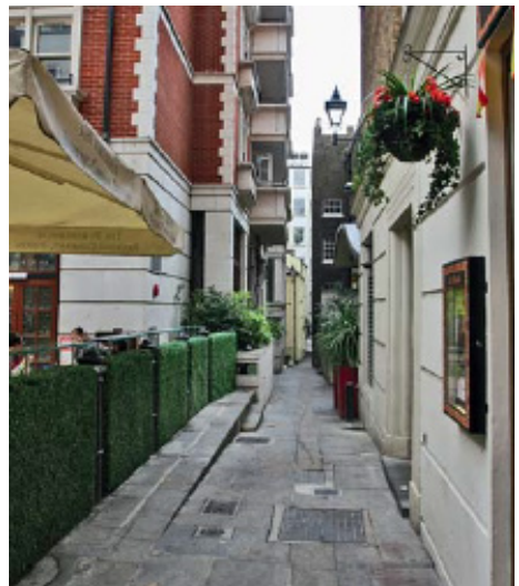
Strand, next to Exchange Court, through the arch and next to the house no. 419A - is the site of the first Russian Orthodox Church in London.

-How many parishioners are there in your parishes? Are there more Russian immigrants or British people? What are their relations like?