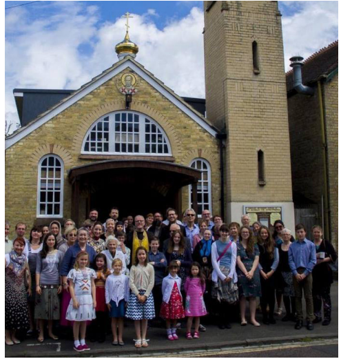
Parishioners of St Nicholas parish in Oxford