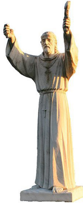
A statue of St Finnian in Clonard