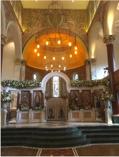
Cathedral's interior after the renovation 2016 r