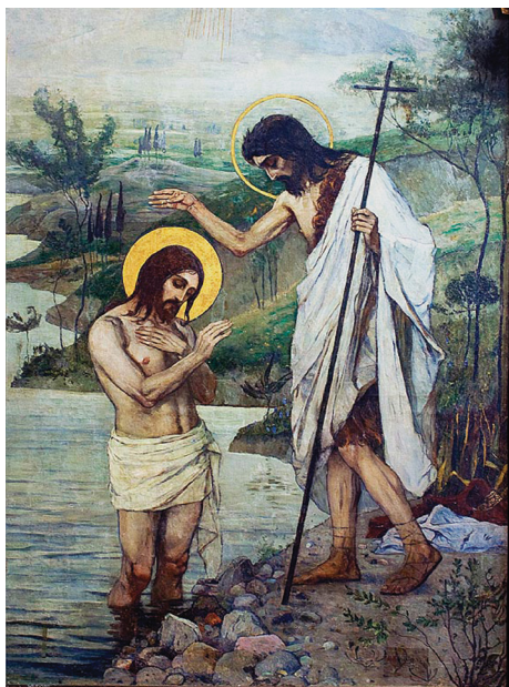
Holy Theophany, M. Nesterov (1890-1894)

Painting inside St Volodymyr's Cathedral, Kiev