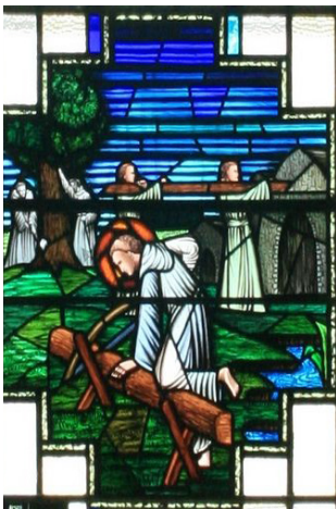
Image on the right: Stained glass 'Building the monastery' at St Finnian's Catholic Church in Clonard

In Clonard today pilgrims can find an old unused Anglican Church of St Finnian; a Catholic Church of St Finnian which contains stained glass of the saint with his disciples; a statue of St Finnian; an old monastic cemetery; a recently restored holy well. In the village of Myshall in Carlow, where Finnian was born, there are ruins of a pre-Norman church, which was ruined under Cromwell in the seventeenth century. In the village of Aghowle there is the twelfth-century monastic church on the site of a monastery built