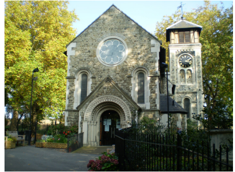
Old St Pancras Church

The exact date of the foundation of St Pancras Church is unknown. Although it is first mentioned in twelfth-century documents, it stood on this site much